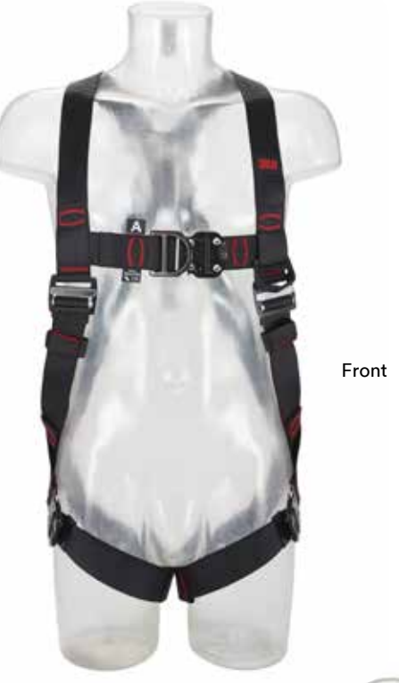
Compatible for use with Secumar Personal Flotation Device models: